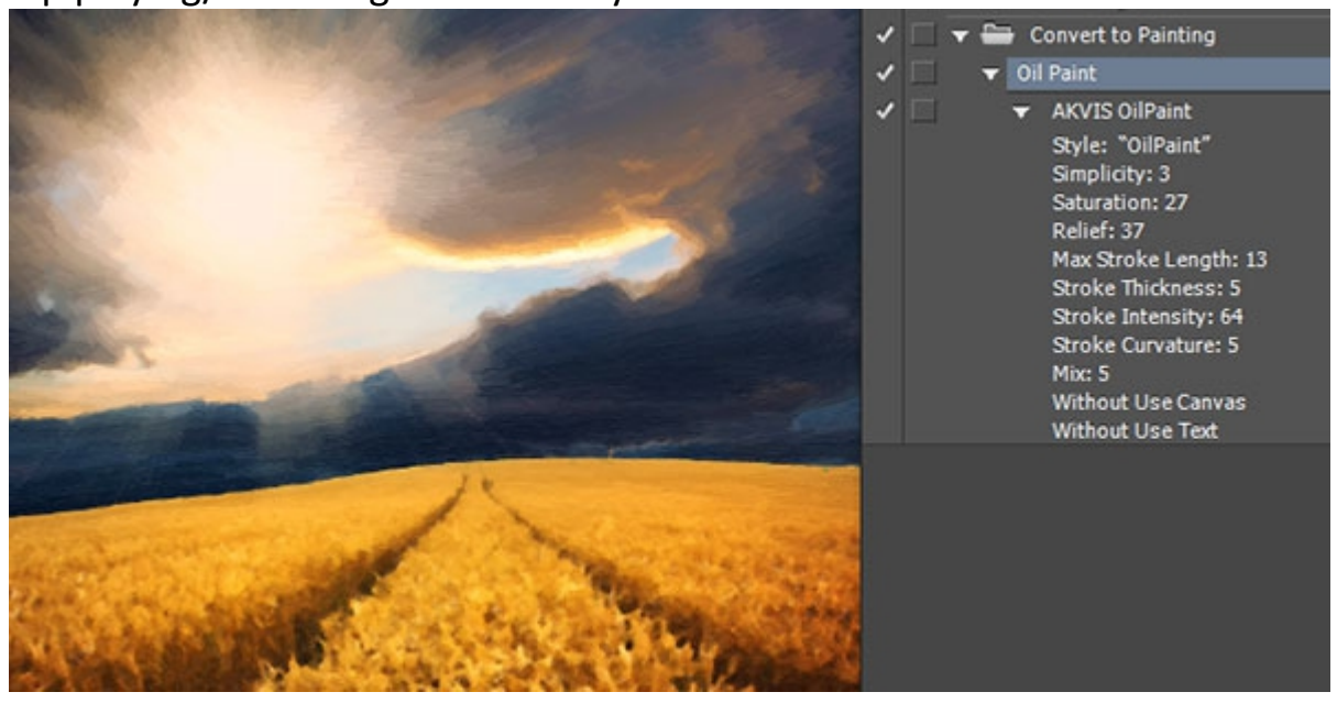
image as you are usually doing. After returning to Photoshop window click Stop playing/recording button and you are done.

Crop tool is great addition in standalone version of Oil Paint. Every little and a while you will see some silly things at the edges of your photo. It is easy to discard them or to recompose photo without any additional external application. On top of all Crop tool is non-destructive what means cropped pixels will be there but hidden from you and if you decide to save file that portion will be removed. In case you are not satisfied just click Crop tool icon and it will show you entire image as it is imported in Oil Paint.